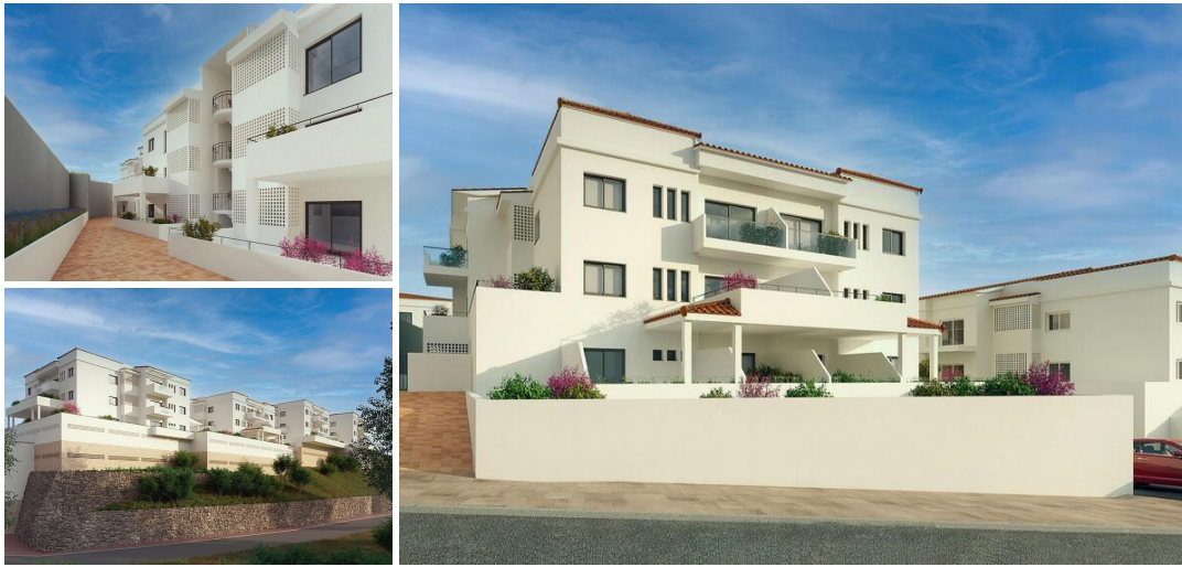
New project of 71 apartments in Fuengirola

Ideally located 7 minutes from the beaches of Fuengirola, Los Boliches, Torreblanca, beautiful 2, 3 and 4 bedrooms flats with one parking space and storage. Possibility to buy a 2nd parking space.