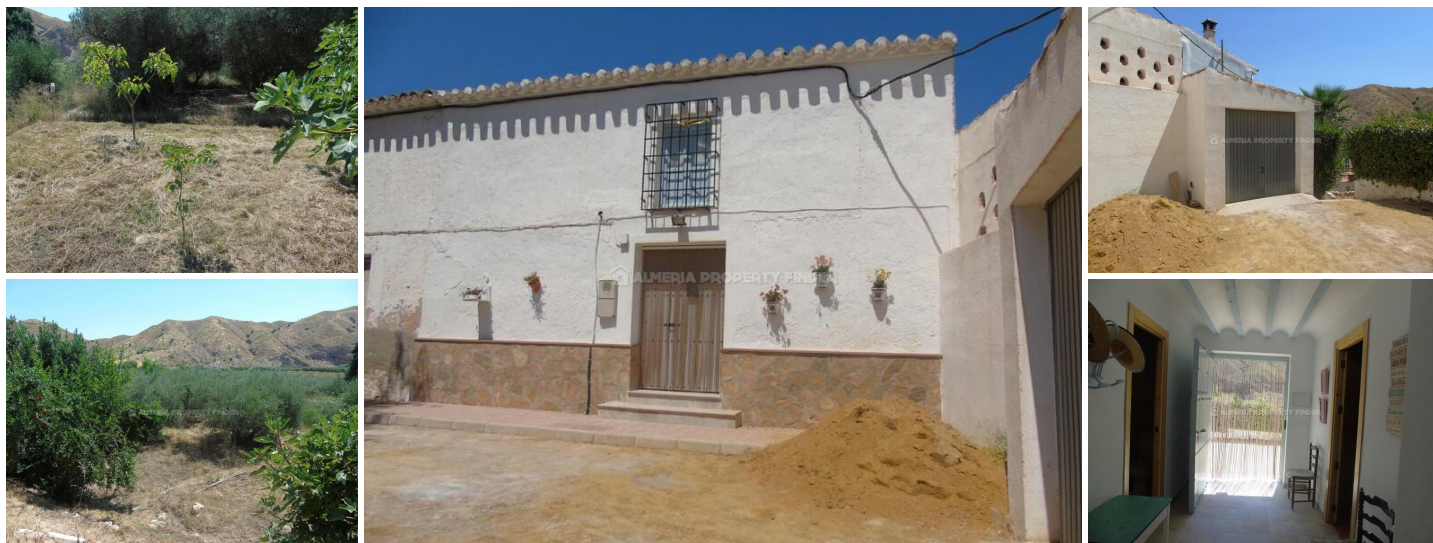
Cortijo Higuera - A country house in the Cantoria area. (Renovated)

A charming renovated traditional two storey property semi- detached 4 bedroom country house for sale in Almeria Province.