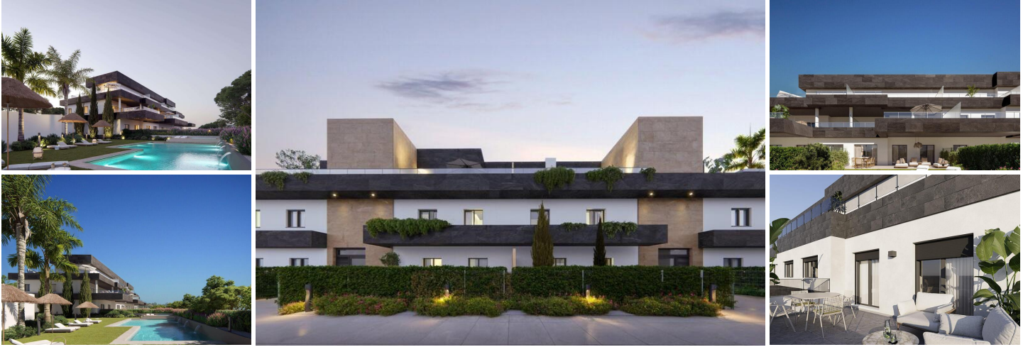
New Residential Complex Near Doña Julia Golf – Modern Homes with Spectacular Views