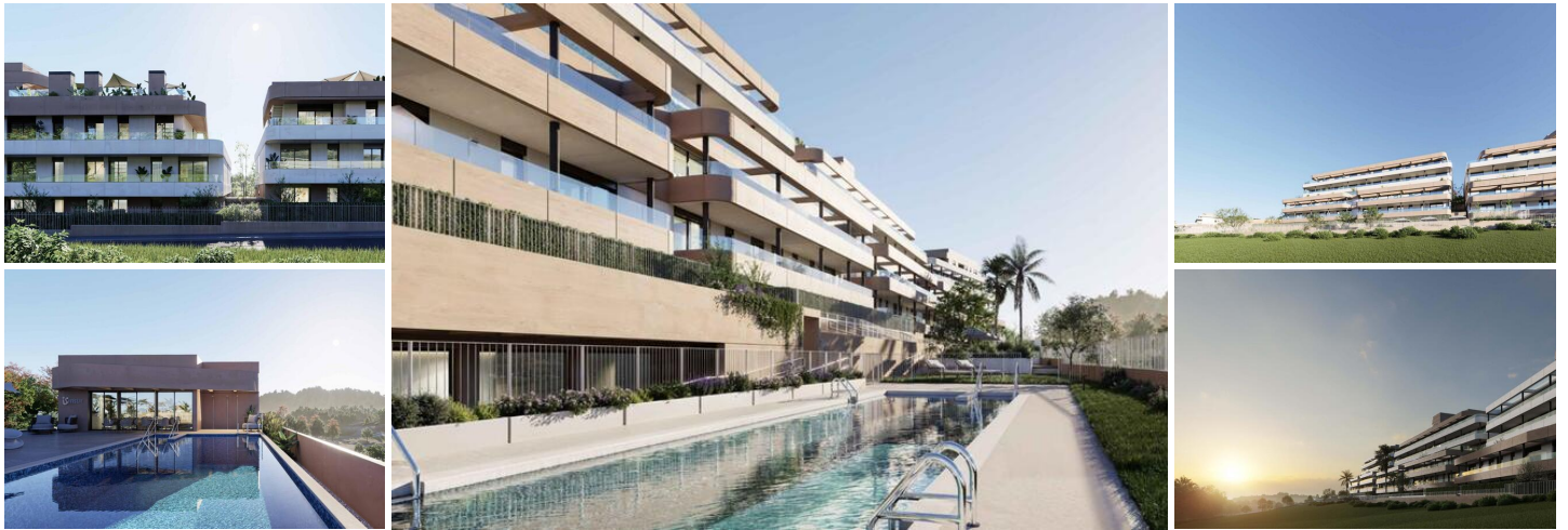
New Build Apartments for Sale in Estepona Golf with Sea and Golf Views