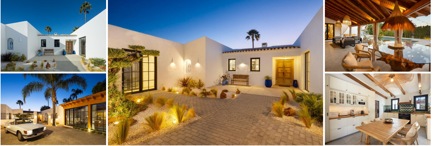
Stylish 8 - Bedroom Villa in Guadalmina Alta, San Pedro de Alcántara

This beautifully presented 8-bedroom, 7-bathroom villa (including 3 en-suite) is situated in the prestigious Guadalmina Alta area, just minutes from golf, shops, schools, and the beach. Occupying a generous 1,400 m 2 plot with 404 m 2 built and 386 m 2 of interior space, the home enjoys a south-facing orientation, ensuring natural light throughout the day.