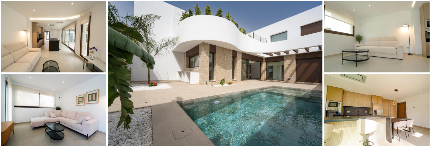
Wonderful 3-bedroom villa with pool and parking in Las Heredades

Upon entering the ground floor, you will discover a spacious living room filled with natural light that invites socialising and relaxation. The modern and functional kitchen is integrated into the living room, creating an open and welcoming space. On this same floor, there is a master bedroom with an en-suite bathroom, offering privacy and comfort, as well as an additional guest toilet.