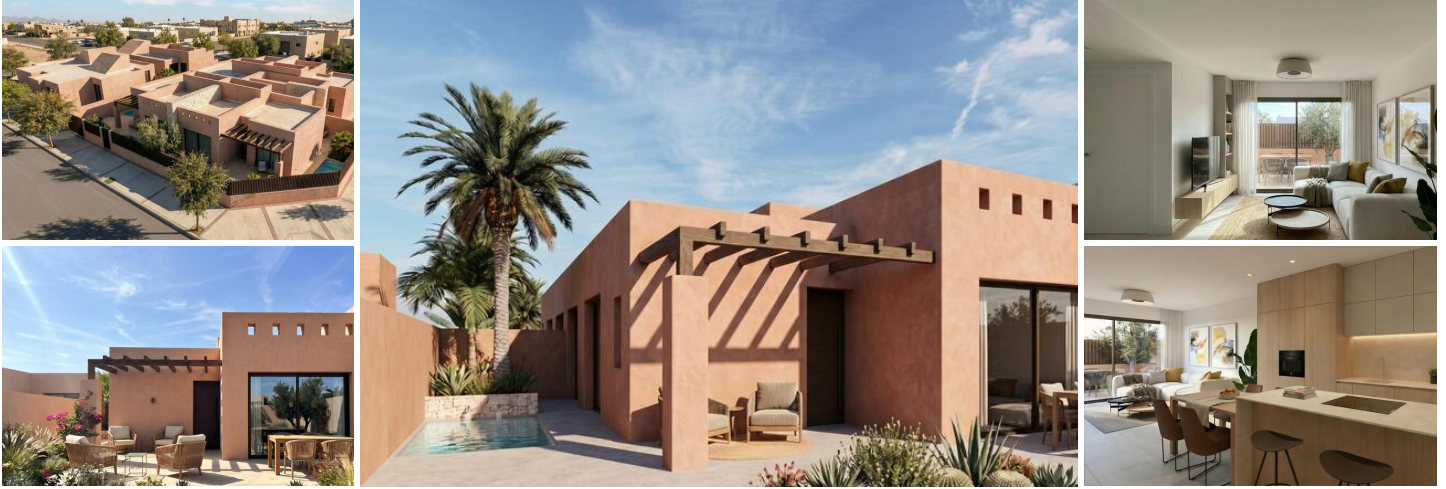
New-build villas at El Alba Mediterranean Resort, in Torre Pacheco