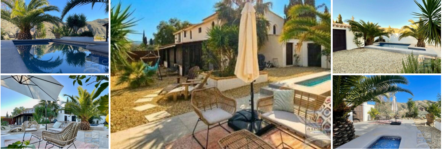
Casa Valley – A Beautiful 4 bed, 2 bath home with private pool set in the Cantoria valleys.

This stunning 4 bed, two bath country house can be found through the peaceful valley of Huerta de Judas in Cantoria, the landscape opens into a scene of olive groves, mountains, and endless sky. Just a few minutes from the vibrant town of Albox.