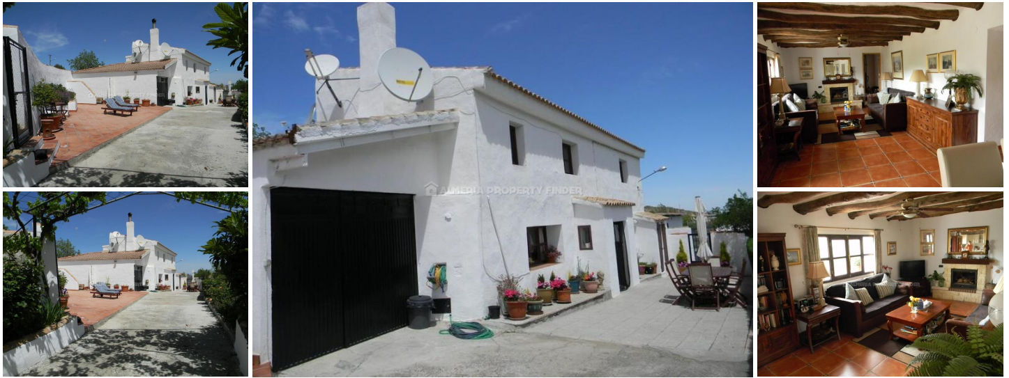
Cortijo Delauna - A country house in the Caniles area. (Renovated)

A beautifully renovated 3 bedroom, 2 bathroom country cortijo with fantastic views, having a build of 208m 2 , is fully gated and located in a small hamlet on the edge of the Sierra de Baza National Park, accessed via a tarmac road.