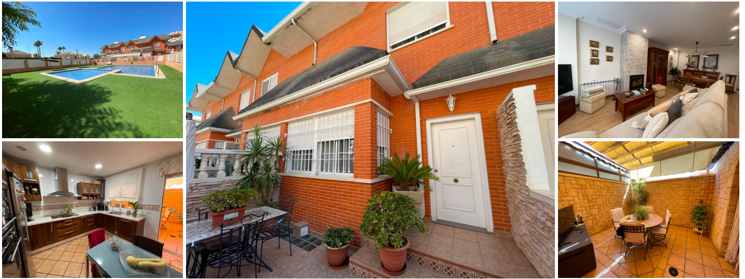
Exclusive Townhouse in Elche

Discover this magnificent townhouse with 4 bedrooms and 3 bathrooms, located in one of the most sought-after areas of Elche. A spacious and bright property in excellent condition, perfect for families seeking comfort, space, and quality of life.