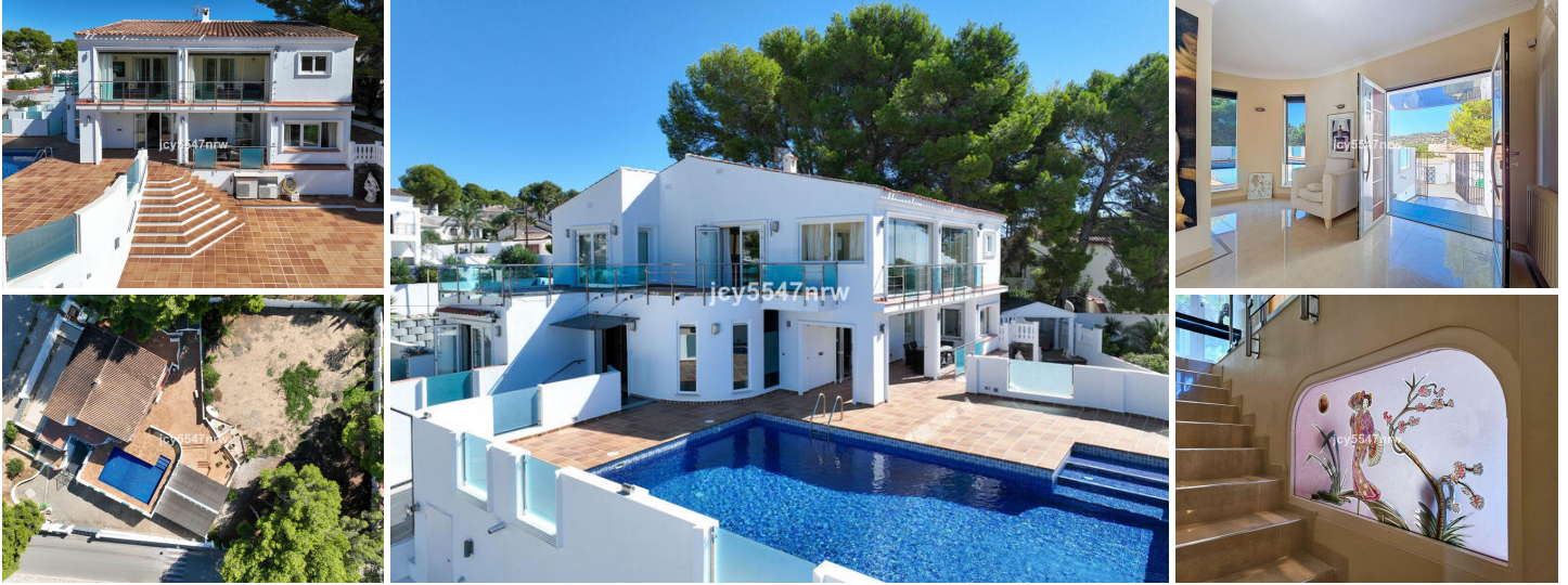
Dream Villa in San Jaime: Luxury, Privacy, and Proximity to the Sea

Located in the popular urbanization of San Jaime, on the border between Moraira and Benissa, you will find this stunning villa. First of all, the corner plot on which the villa sits is equipped with two electric access gates for cars and a pedestrian gate, providing easy access.