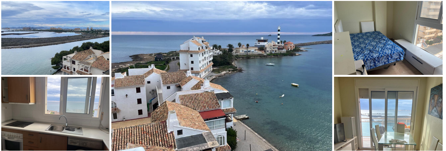
Apartment for Sale – La Manga del Mar Menor (Murcia)

Located in the well-established Edificio Paraíso del Sol, this bright sixth-floor apartment offers an excellent opportunity to own a holiday or investment property in one of La Manga's most sought-after areas, just a short walk from the Mar Menor waterfront.