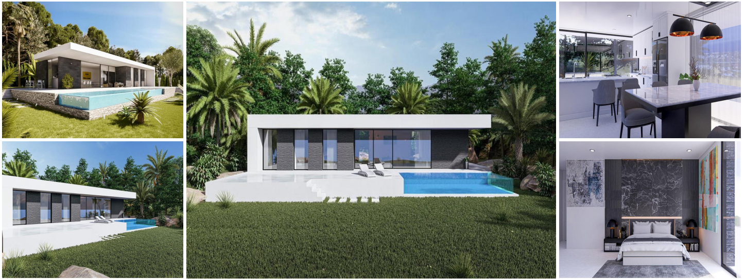
Ibiza-Style Villa Project – Custom Design Opportunity in Monte Solana, Pedreguer

Starting from €670,000, this beautiful Formentera-style villa project is set on a sunny south-facing 800 m 2 plot in the highly desirable Monte Solana area of Pedreguer, offering open views, tranquility, and excellent connectivity.