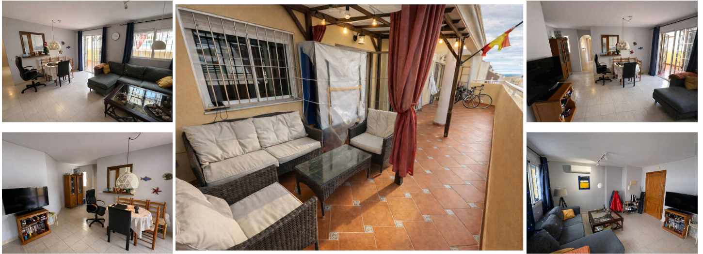
Penthouse with Large Terrace Near the Sea – Torrevieja, Alicante

Located on Calle Los Gases, this bright and well-laid-out penthouse is just 500 metres from Playa del Cura and within easy walking distance of shops, restaurants and all daily amenities. A fantastic central location in Torrevieja, ideal for both living and holidays.