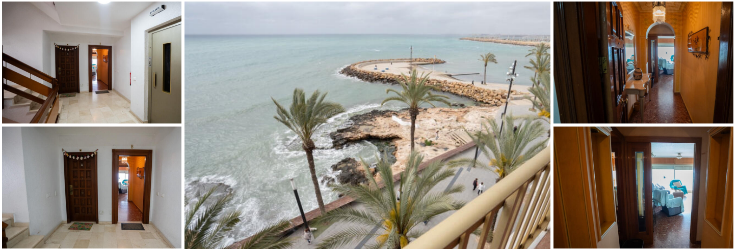
Charming Mediterranean-Style Seafront Apartment with Breathtaking Views in Torrevieja

Nestled right beside the sea in Torrevieja, this exquisite Mediterranean-style apartment offers a unique blend of elegance, comfort, and stunning panoramic views. The spacious living room flows effortlessly into a massive 180° long balcony, providing uninterrupted views of the entire Torrevieja seafront and the sparkling Mediterranean waters. Whether you're enjoying a quiet moment or entertaining guests, the views will take your breath away.