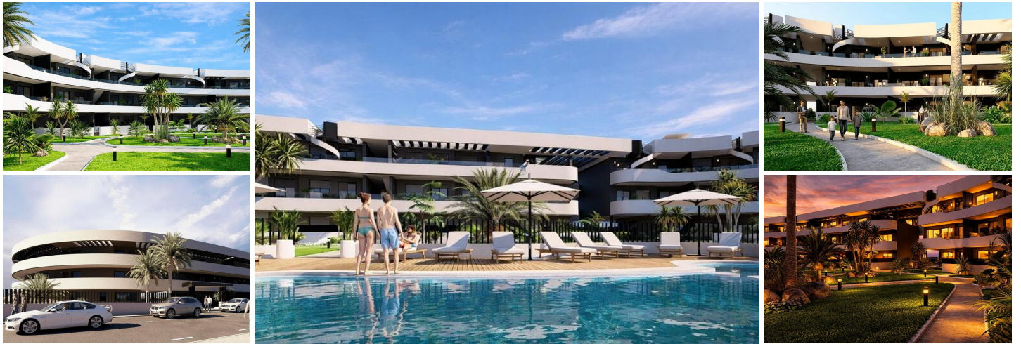
Luxury Golf Front Apartments Near the Sea in Los Alcazares Costa Calida