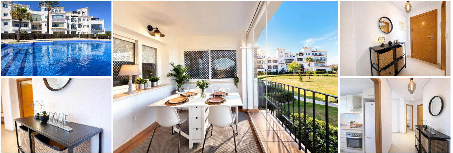
Beautiful 2-Bedroom Apartment in Hacienda Riquelme Golf Resort – Calle Atlántico

This well-presented two-bedroom, one-bathroom apartment is located in the sought-after Hacienda Riquelme Golf Resort, on Calle Atlántico, just a short walk from one of the communal swimming pools.