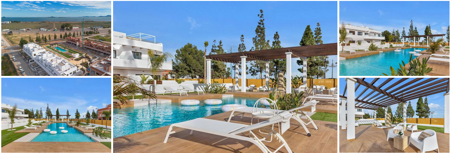
New Build Residential Complex Near Serena Golf and the Mar Menor in Los Alcazares