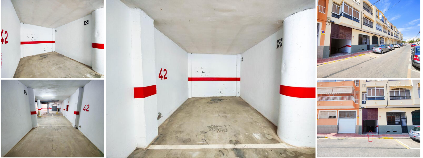
Parking space for sale on Calle del Palangre 23, Torrevieja

Convenient parking space for sale in Torrevieja, located on the -1 floor of a well-maintained garage at Calle del Palangre 23, just a few steps from Playa del Cura beach and the promenade