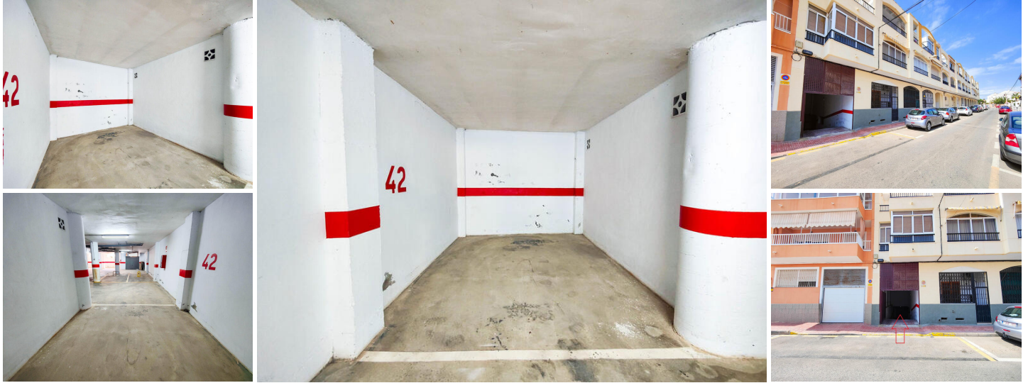
Parking space for sale on Calle del Palangre 23, Torrevieja

Convenient parking space for sale in Torrevieja, located on the -1 floor of a well-maintained garage at Calle del Palangre 23, just a few steps from Playa del Cura beach and the promenade.