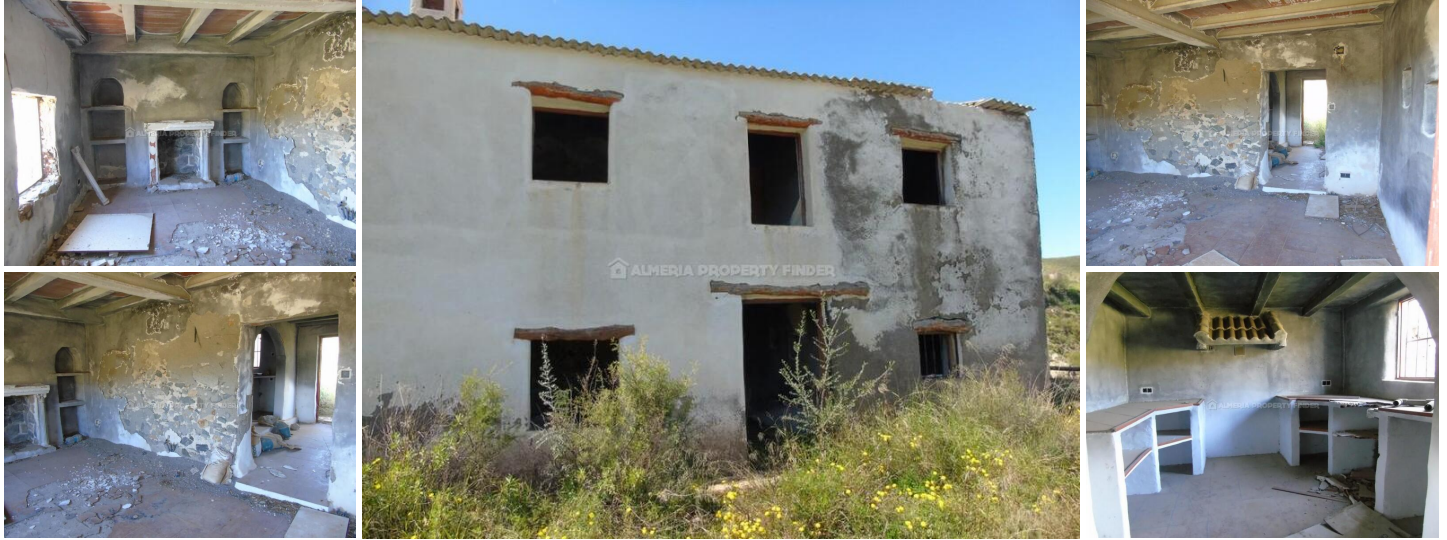
Cortijo Calli - A country house in the Cantoria area. (For Renovation)

A detached 3/4 bedroom country house for sale in the province of Almeria, a 3 minute walk to the local bar or a 30 minute stroll and within a 14 minute drive of the pretty village of Arboleas which has all the amenities you require for day to day living including a supermarket, general store, brand new medical centre, chemist including a supermarket, general store, brand new medical centre, chemist, post office, banks, a gym, pavement tapas bars and a weekly street market on Saturdays. The larger town of Albox with many more facilities is about a 30 minute drive away. The golden Mediterranean beaches of Vera Playa, Mojacar, Garrucha can be reached in 35 minutes and there are three airports within easy commute via excellent motorway connections, Almeria, Murcia and Alicante.