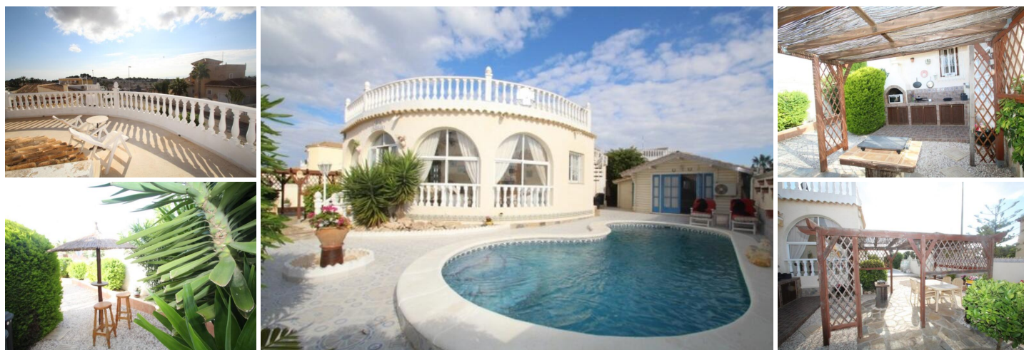
Large South Facing Detached Villa with Private Pool in Villamartin