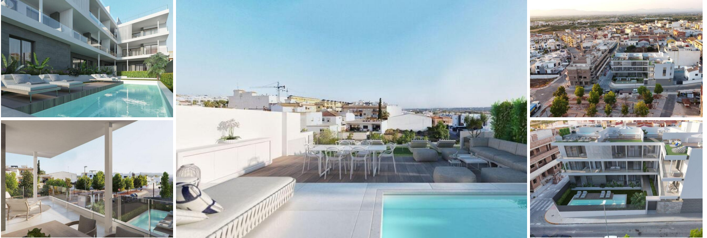
New Build Apartments in Benijofar with a central location