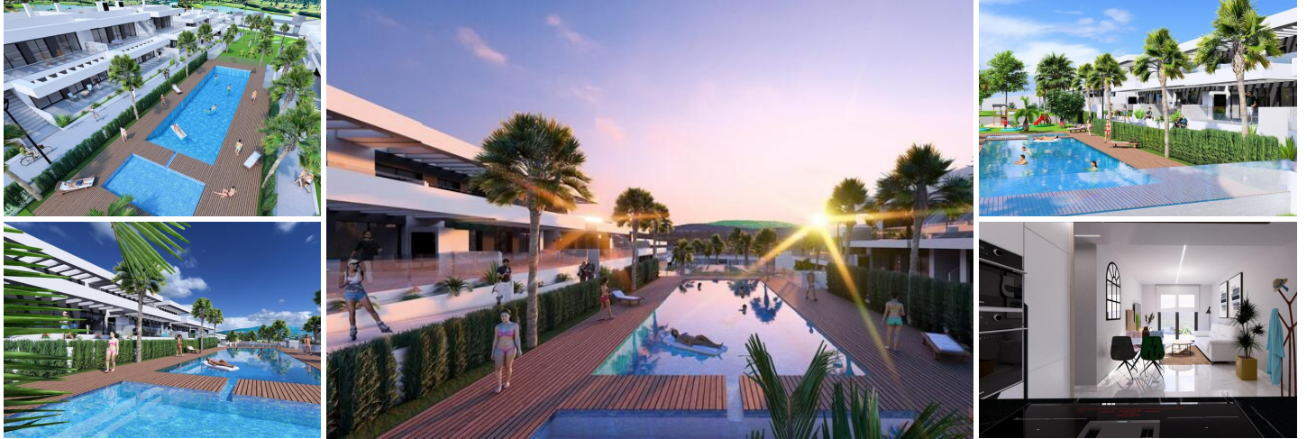
Exclusive New Construction Bungalows in La Finca Golf, Algorfa