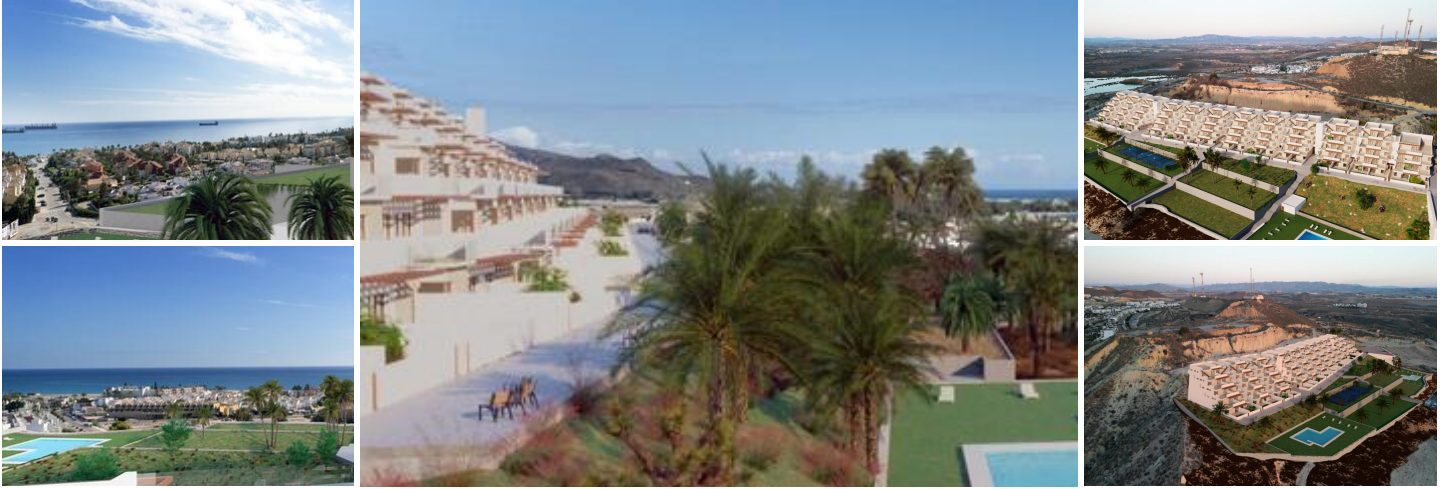
New Build Apartments with Sea Views in Vera Playa, Almería

Discover this exceptional new residential development in Vera Playa, offering 27 modern apartments in its first phase. Designed to combine comfort, functionality, and spectacular Mediterranean views, this project is ideal for those seeking a home on the Costa de Almería with style and convenience.