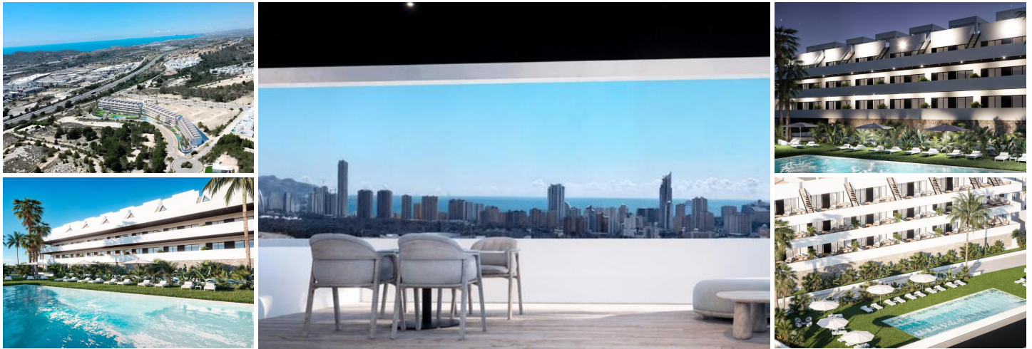
Exclusive New Build Residences with Sea Views in Finestrat, Alicante

Prime Location with Panoramic Views of Benidorm and the Mediterranean