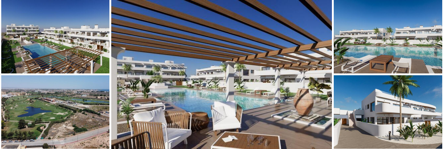
New Build Residential Complex Near Serena Golf and the Mar Menor in Los Alcazares