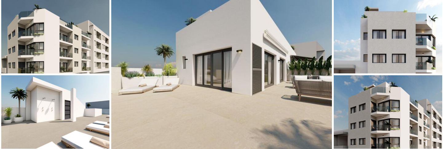
Modern New Build Apartments in Guardamar del Segura Near the Beach