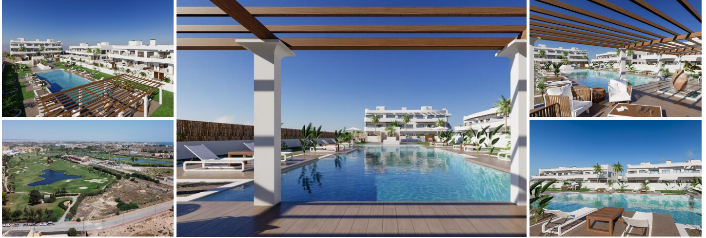
New Build Residential Complex Near Serena Golf and the Mar Menor in Los Alcazares