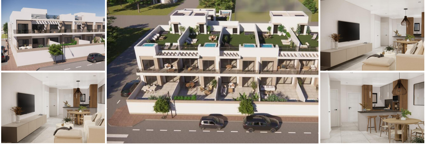
New Build Apartments in Rojales Close to Golf and Beaches