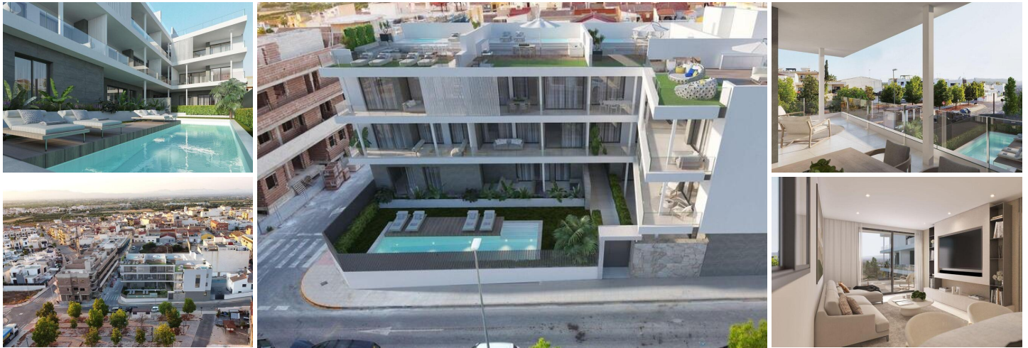
New Build Apartments in Benijofar with a central location