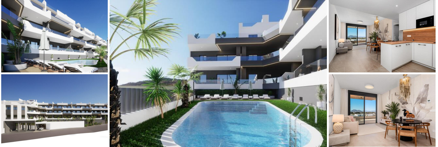
NEW BUILD BUILD RESIDENTIAL COMPLEX IN BENIJOFAR

New Build residential complex in the quiet area of Benijofar.