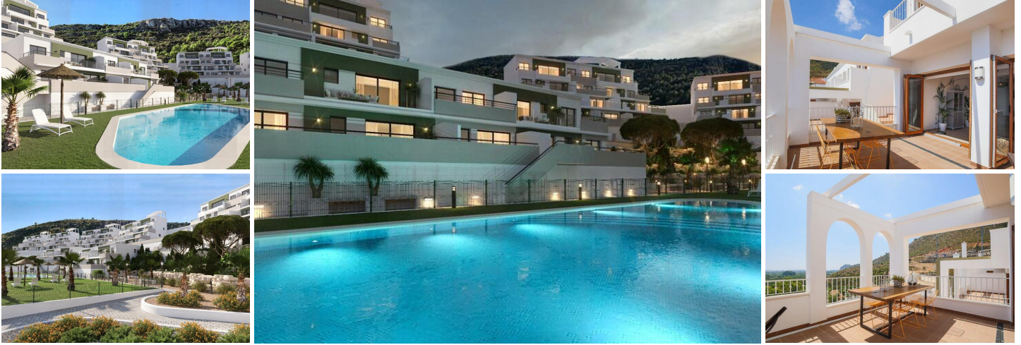
New Build Apartments with Sea Views in Xeresa Costa Blanca North