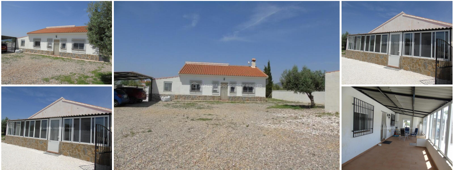
Villa Manzana - A villa in the Partalaoa area. (Resale)

!!! EXCLUSIVE TO ALMERIA PROPERTY FINDER !!!