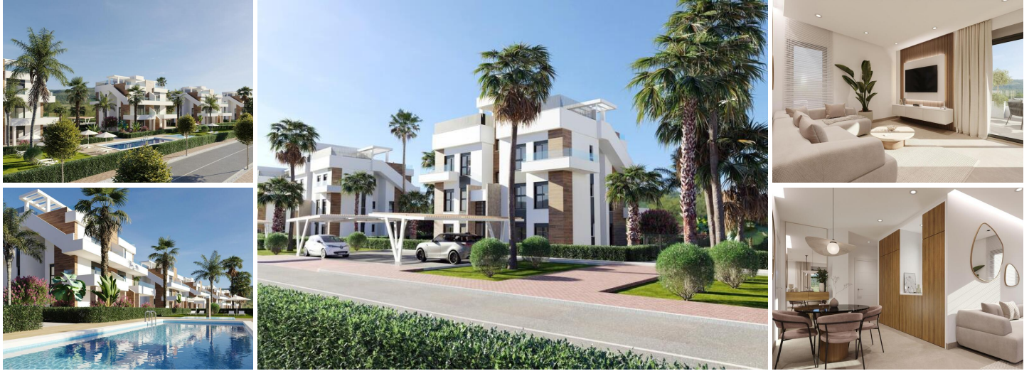
New Build Apartments in Hacienda del Álamo Golf Resort, Murcia