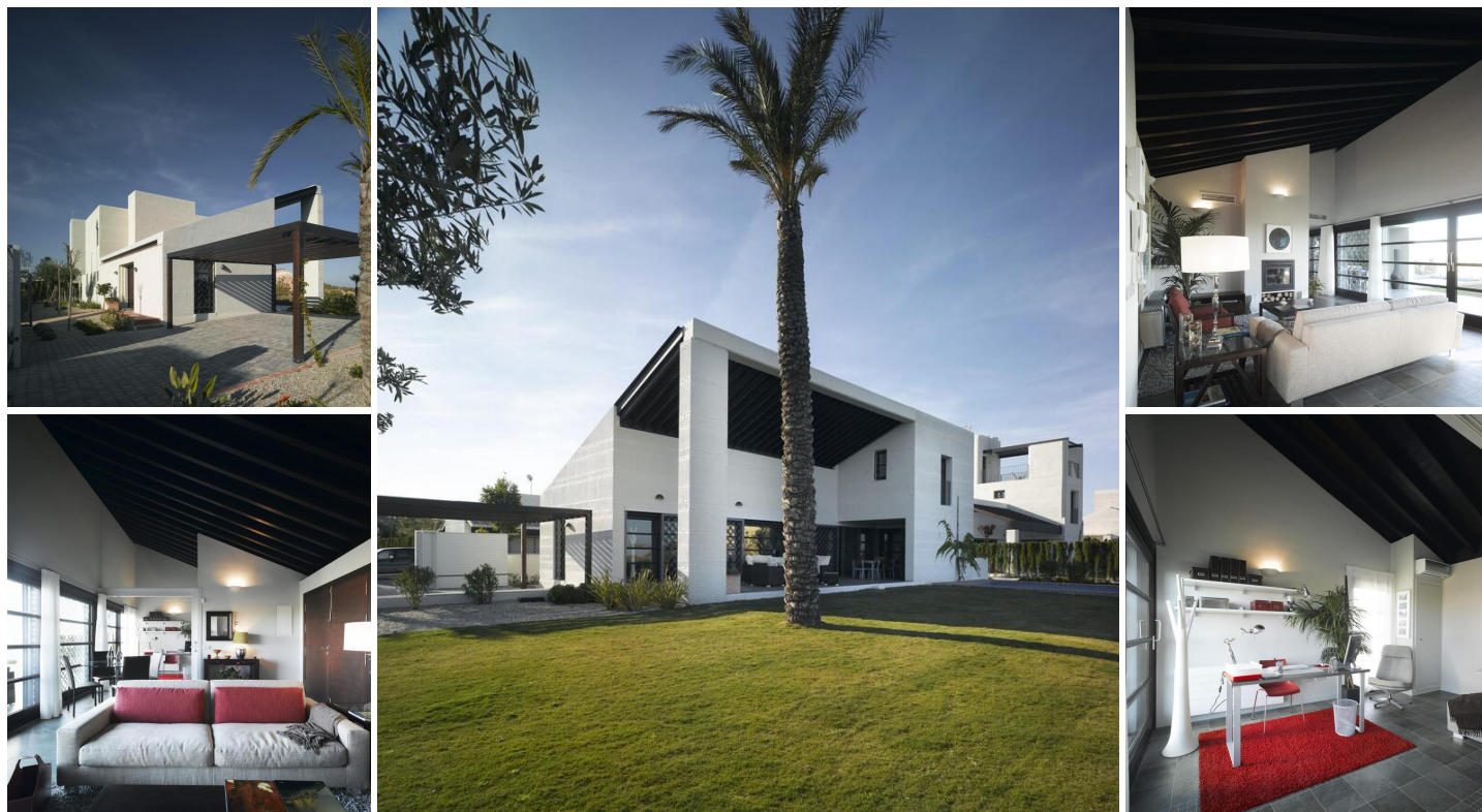
Elegant detached villas with private pool at Peraleja Golf Resort - Costa Cálida

Mediterranean-style detached houses in a gated golf community