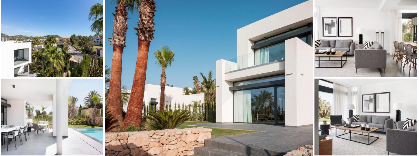
New Build Villas for Sale at La Manga Club – Luxury Living in a Prestigious Resort