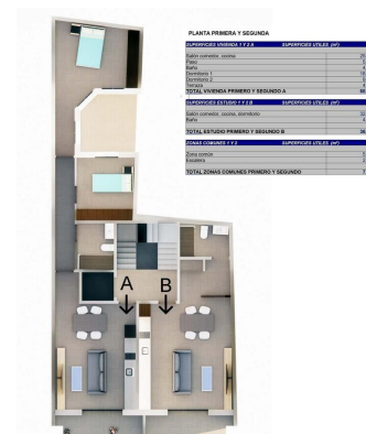
Planta Primera y segunda. Estudio B y Vivienda A