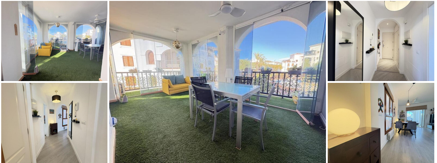
Elegant Two-Bedroom / Two Bathroom Apartment with Pool Views € Valle Golf Resort

Set within the prestigious Valle Golf Resort, this beautifully presented two-bedroom, two-bathroom apartment offers an exceptional opportunity for both lifestyle buyers and savvy investors seeking quality, location, and long-term value.