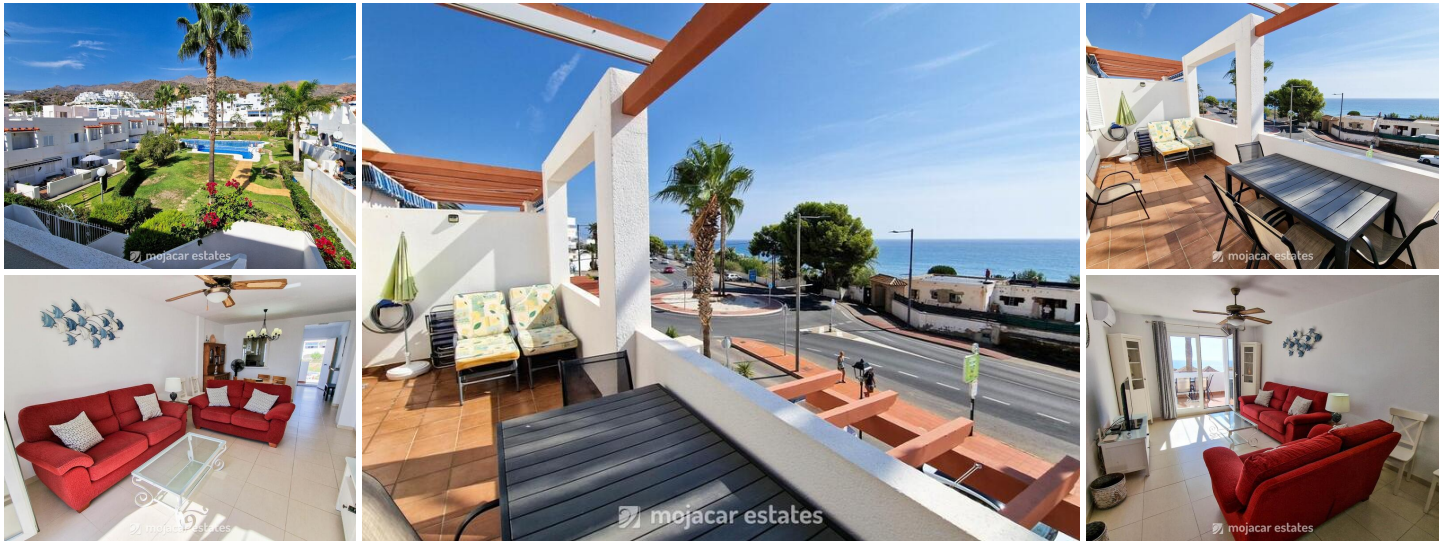
Top-Floor Frontline Apartment For Sale with Sea Views in Mojácar Playa, Almeria, Andalusia

This top-floor frontline apartment is ideally located in a highly sought-after area at the south end of Mojácar Playa, right at the start of the well-known Las Ventanicas beach and directly opposite the 2.5 km seafront promenade.