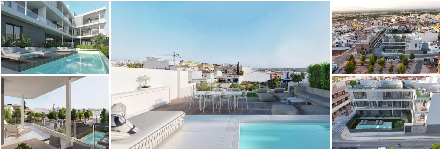
New Build Apartments in Benijofar with a central location