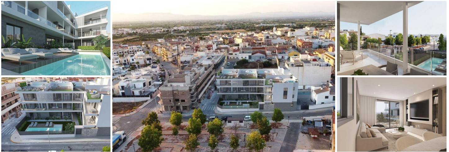
New Build Apartments in Benijofar with a central location