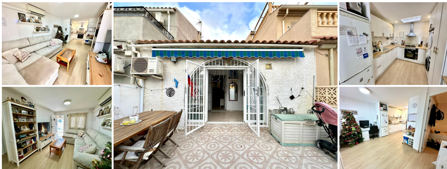
Charming Two-Bedroom Bungalow with American-Style Kitchen in La Siesta

Two-bedroom bungalow for sale in the heart of La Siesta, close to Torrevieja and within walking distance of local shops, restaurants, and the beautiful Blue Lagoon of La Mata.