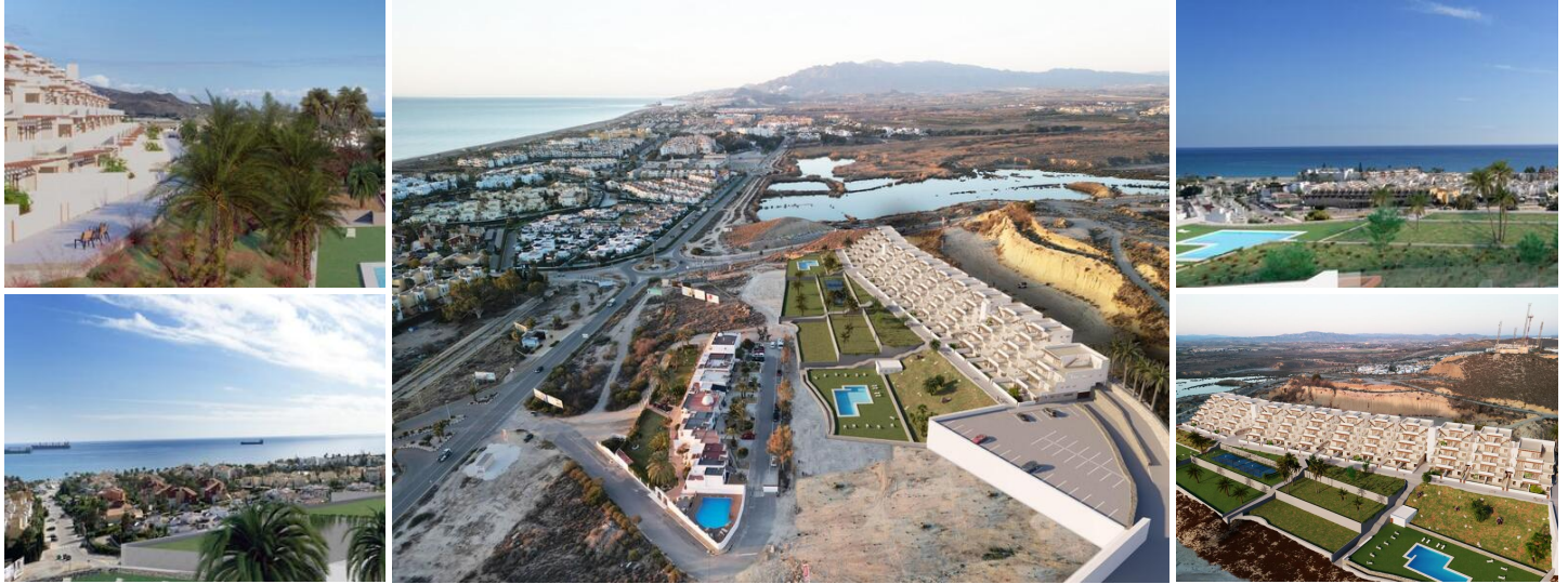
New Build Apartments with Sea Views in Vera Playa, Almería

Discover this exceptional new residential development in Vera Playa, offering 27 modern apartments in its first phase. Designed to combine comfort, functionality, and spectacular Mediterranean views, this project is ideal for those seeking a home on the Costa de Almería with style and convenience.