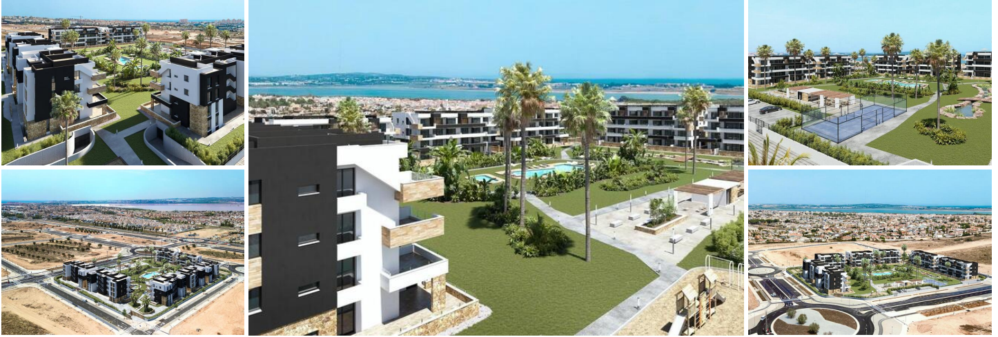
New Residential Development in La Siesta, Torrevieja