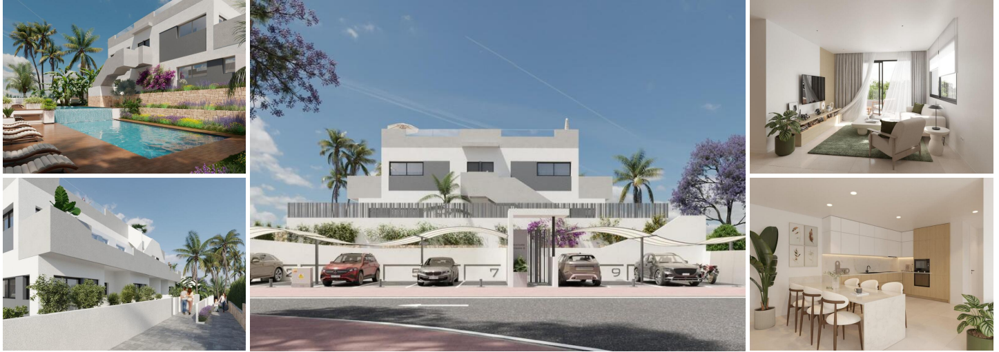
New Build Residential Complex in Los Balcones, Torrevieja