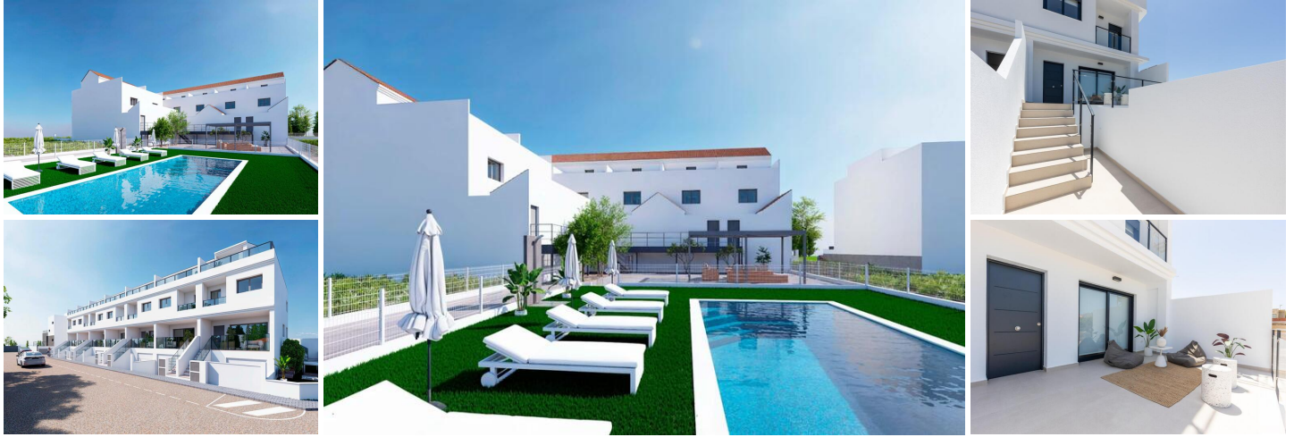
Modern Townhouses with Solarium and Basement in Rafal, Alicante