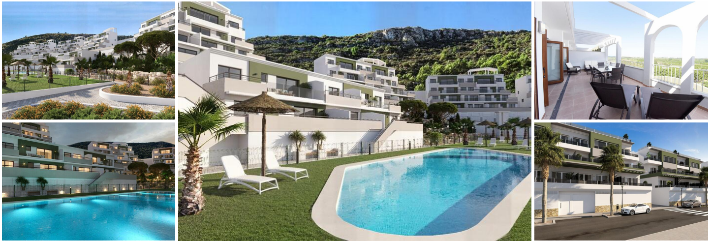
New Build Apartments with Sea Views in Xeresa Costa Blanca North