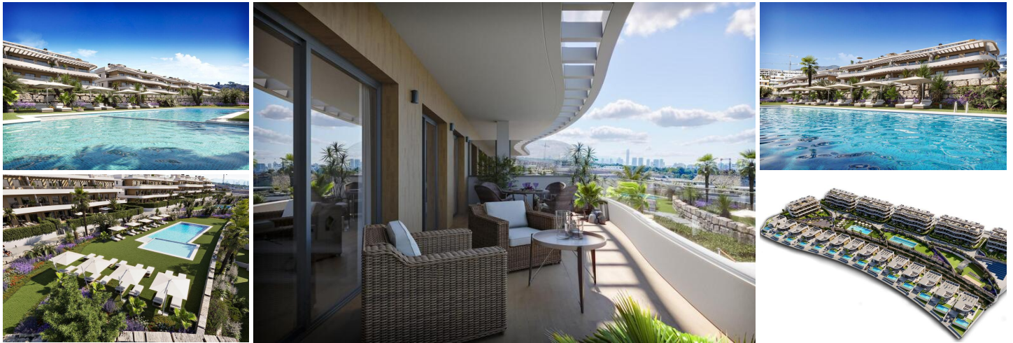
Luxury New Build Apartments and Villas with Panoramic Sea Views in Finestrat