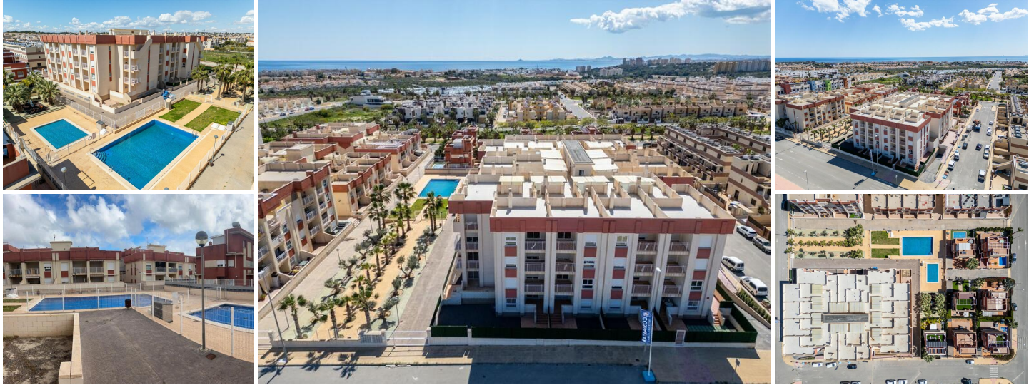
Regenerated Residential Complex in Lomas de Cabo Roig – Renovated Apartments